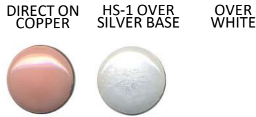
PS-141A Snow White Light ¥2,200.