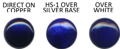
H-75 Ultramarine 8 ¥2,200.