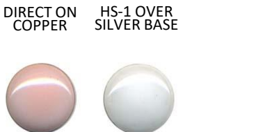
P-141 Snow White ¥2,200.